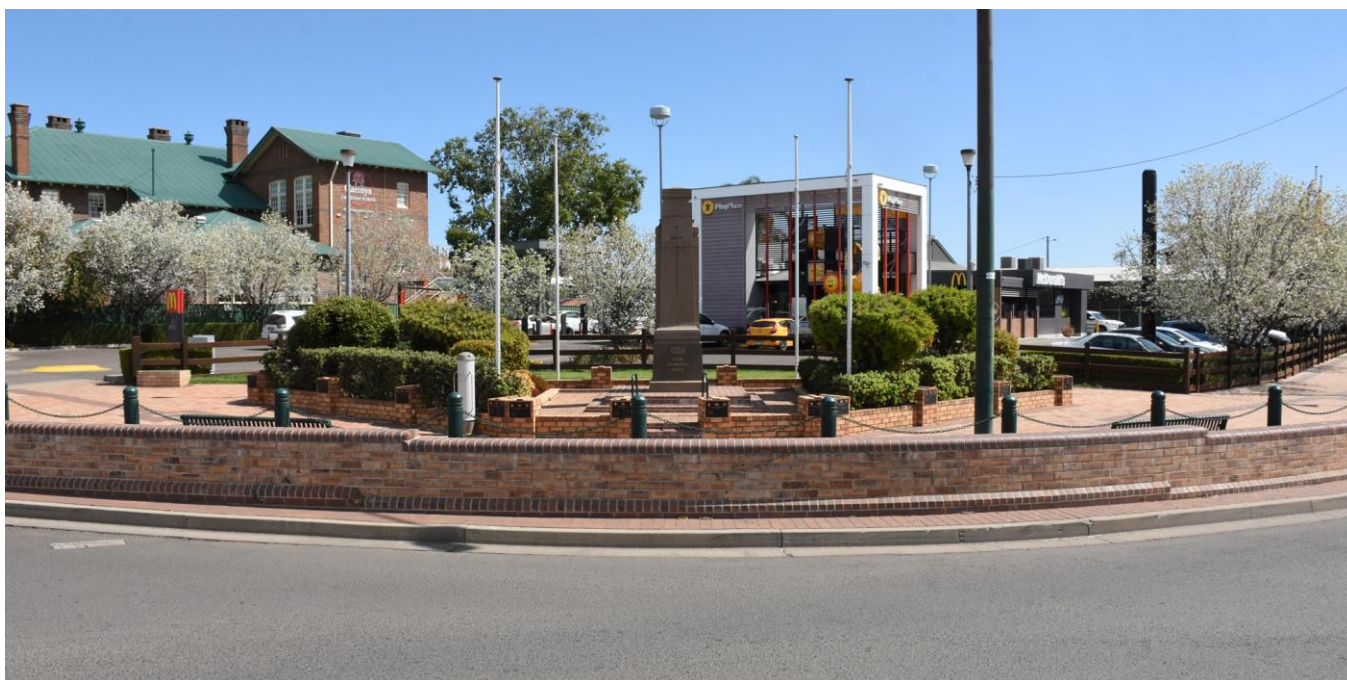
Gunnedah Cenotaph