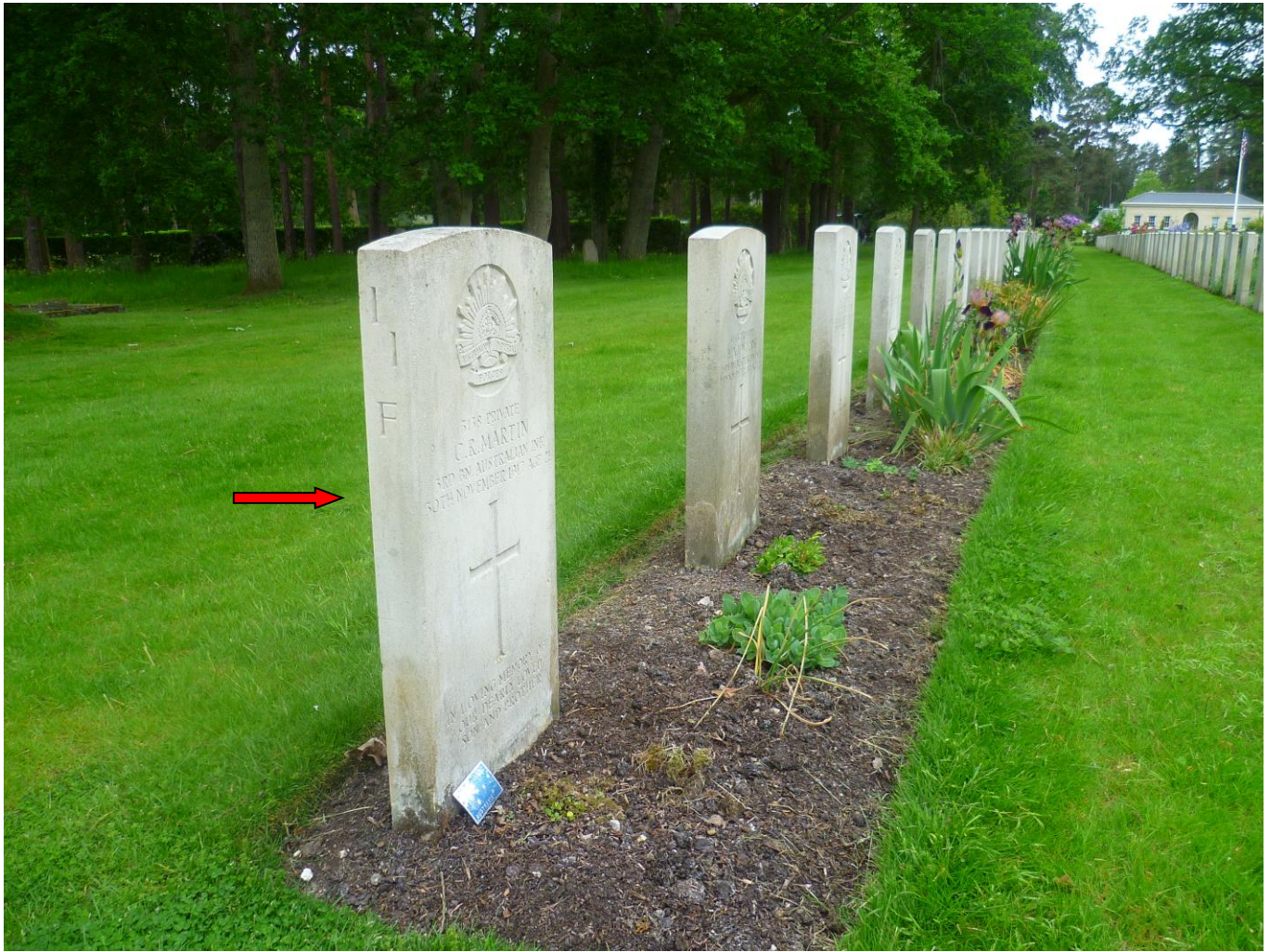
Private C. R. Martin's Headstone (red arrow)