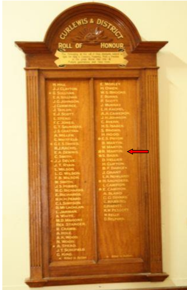
Curlewis & District Roll of Honour