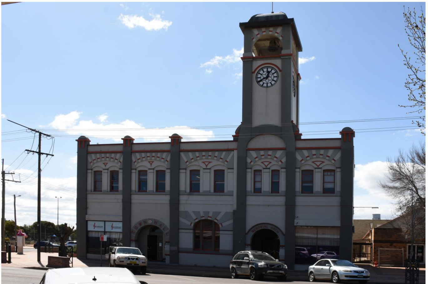
Gunnedah Memorial Clock Tower