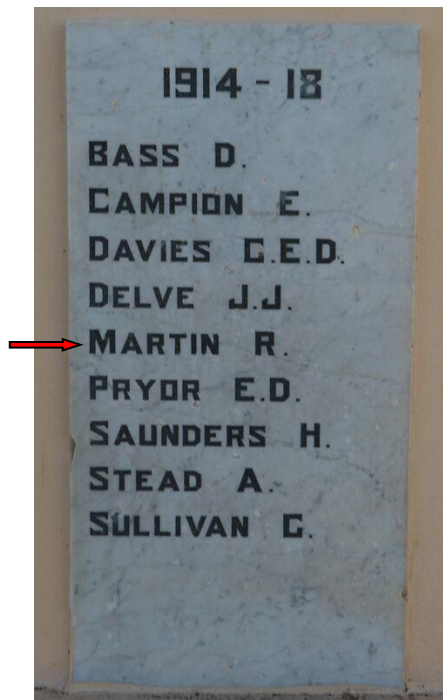
Curlewis War Memorial Gates