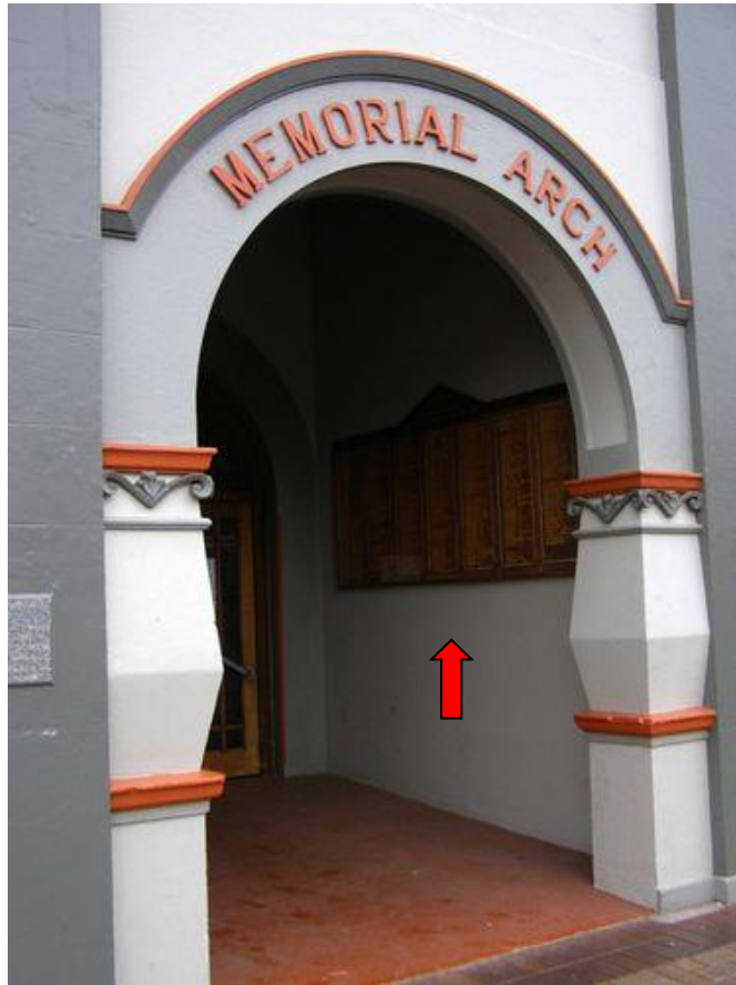
Gunnedah Memorial Clock Tower Roll of Honour